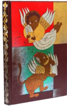
Book of the Gospels